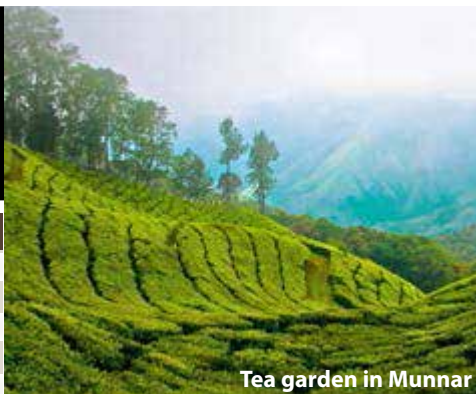
Tea garden in Munnar