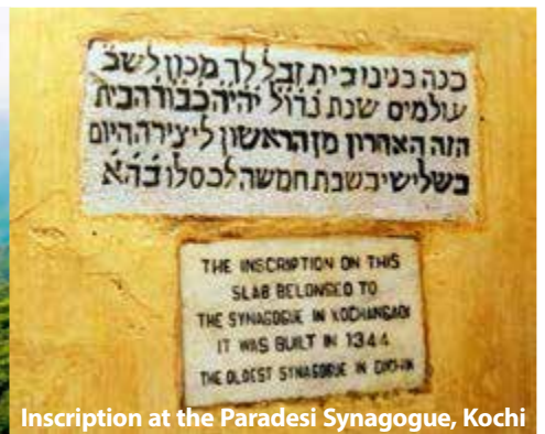
Inscription at the Paradesi Synagogue, Kochi