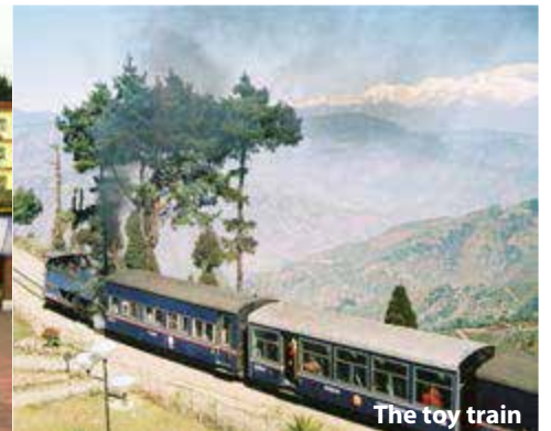
The toy train