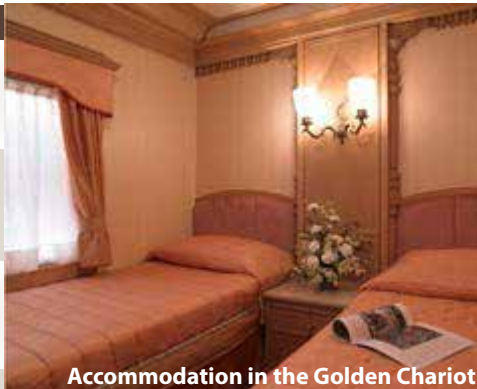
Accommodation in the Golden Chariot