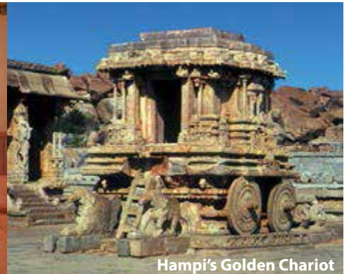
Hampi's Golden Chariot